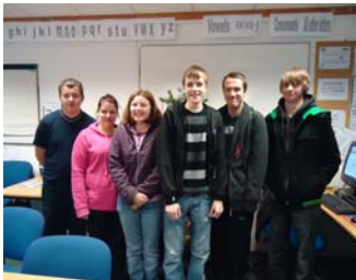
Skills Builder Trainees

From 1st January 2012 Azure will be offering an Extended Work Placement Programme .