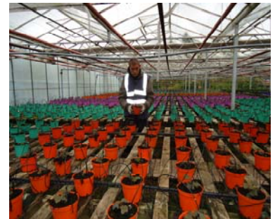
Work Placement in Azure Nurseries

Anyone interested in the programme or wanting more information should contact Toni or Elsa at Azure on 01670 717106 .